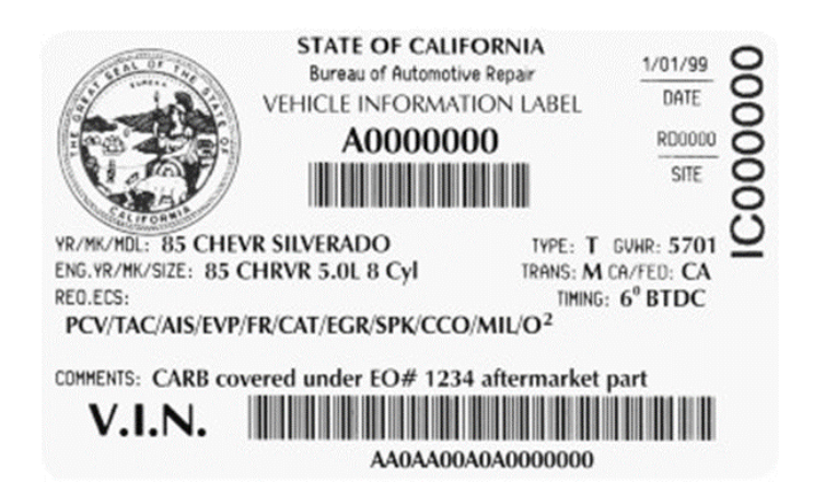
Figure 2: Example of Acceptable BAR Referee Label (all labels must include a serial number)

The BAR Referee Label serves as the emissions control "under-hood" label, providing emission control information for SPCNS, grey market vehicles, vehicles with engine changes, alternative fueled vehicles, and, as needed, other vehicles with unusual configurations. The Referee Label is typically, but not always, affixed to the left front door post. In some cases, the label may be located under the hood.